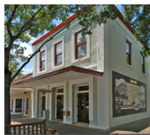
City Office Building, Georgetown Texas